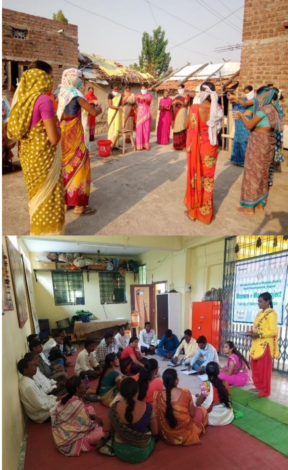
Sensitization campaign on BCC (behavioural changes at community level in various villages facilitated by W + W project volunteers

The project interventions focused on the community based behavioral change aspects, through different levels of sensitization activities like, theater performances, demonstrations, creative events for children and youth etc.