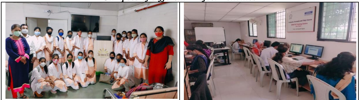
Earning with Dignity