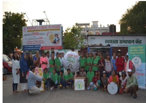
Public Awareness Campaign on Protection of Environment by Children and Youth