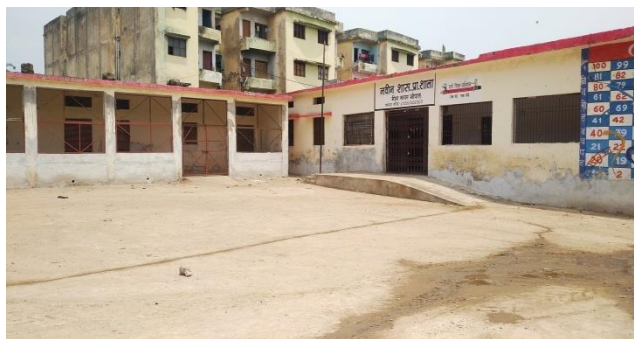
Meera Nagar Primary School before and after construction

Firstly the problem as raised for electricity connection at BAL Chaupal by the children. Electricity connection was provided and also the filling and leveling of the school ground was completed. After the visit of Commissioner BMC, construction work of the school toilets also started.