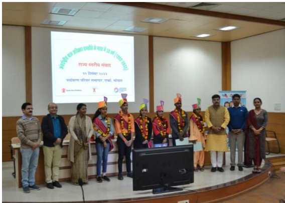
State Consultation on 30 years of UNCRC In India