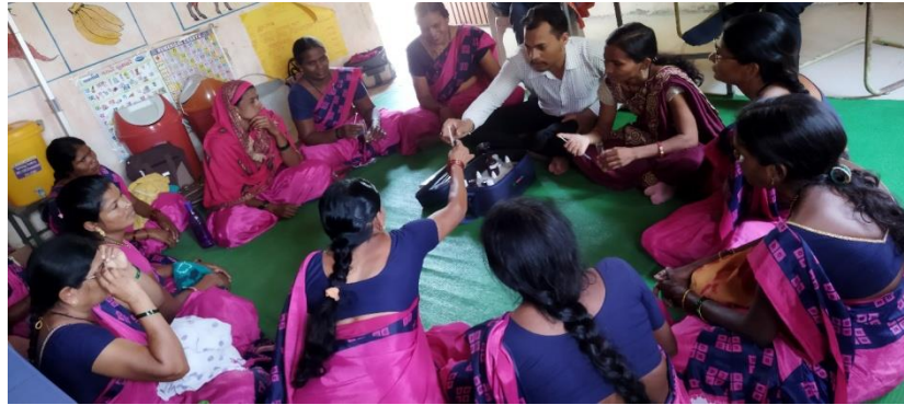
NIWCYD volunteers providing training for the community members on water quality testing

When Women + Water project was started in the district, the primary focus was given community level sensitization on drought, various factors that contributing to its intensification, drinking water crisis, and sustainable solutions to maintain the quality of drinking water. Besides the sensitization, the institutional build up at grassroots level in which representation of beneficiary sections remains prominent was also targeted.