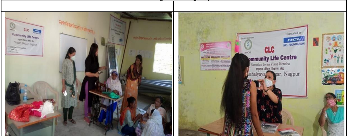
Strengthening of SHGs